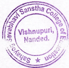
Principal Sahayog Sevabhavi Sanstha College of Education Vishnupuri, Nanded.

The administrative staff and the teaching staff of the college share the the information with various tech devices such as emails, WhatsApp, google drives etc. Affiliating university provided unique login to the college for updatation of eligibility of the students. In the COVID 19 the faculty worked from home and they provided the academic information to the students through various online free access tools. The guest lecturers also organized with the help of ZOOM and GOOGLE MEET.