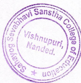
Principal Sahayog Sevabhavi Sanstha College of Education Vishnupuri, Nanded.